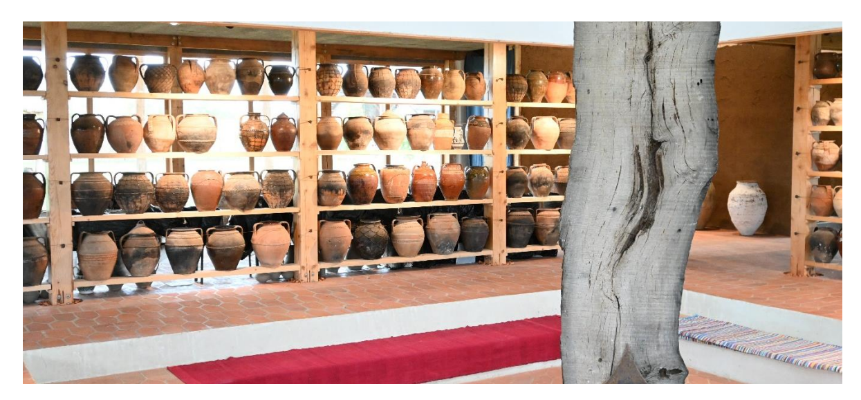
From the wonderful collection of traditional clay pots in Piscu

On September 22<sup>nd</sup> we went to Piscu School and Museum. The organization focus on traditional pottery and the promotion of Romanian crafts, especially among young people, by organizing workshop-style activities and has recently opened a small museum, in addition to their workshop activities.