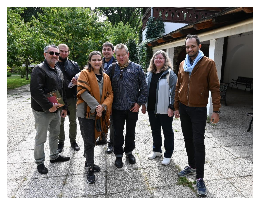
From the visit at the Romanian Village Museum

On 23<sup>rd</sup> September we visited several museums. The 23rd of September was a museum visiting day. First we visited the Romanian Village Museum (an open-air museum, among Top 5 most visited museums in Bucharest). We were provided a presentation about vernacular architecture and crafts involved in building houses the traditional way.