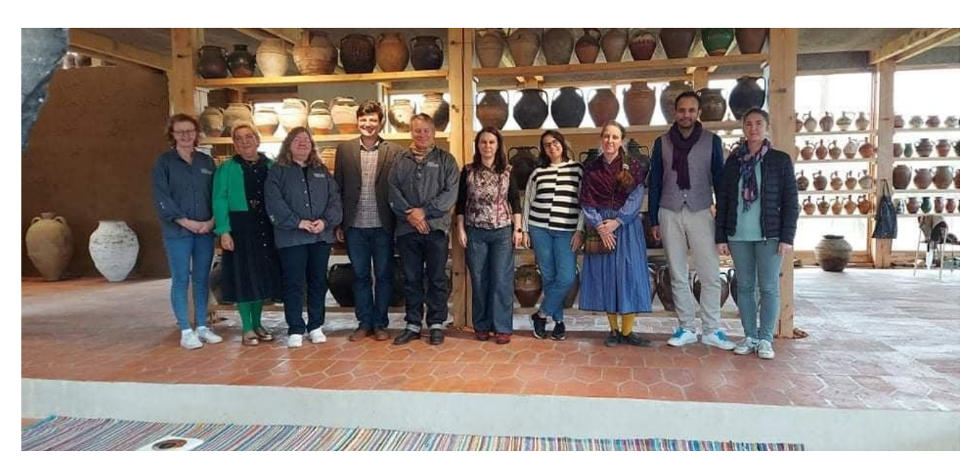
From Norwegian Crafts Institutes visit to Romania